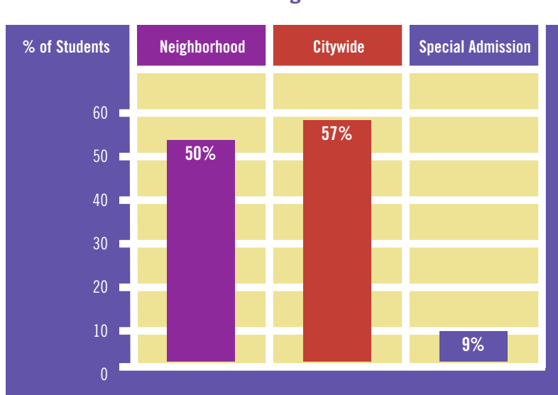
Figure 3.1 First-time Ninth Graders Enrolled in Intensive or Strategic Math

Our qualitative research revealed that charter high schools were likely to be using double dosing for ninth graders as well, as three of the four charter schools in our sample were providing double dosing in math and English to their ninth graders.