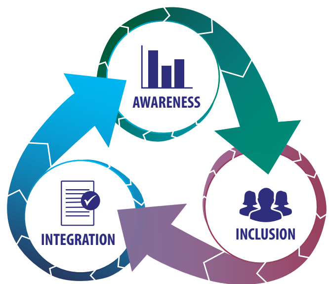
Figure 1. Race Equity Cycle