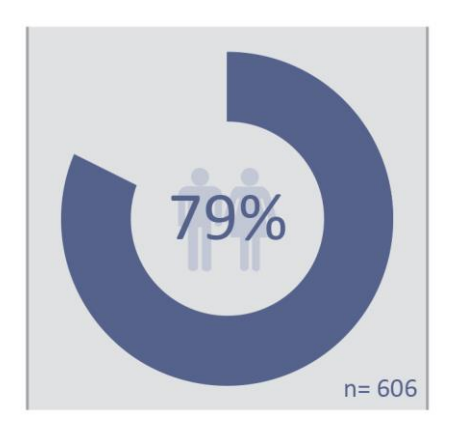
Teachers said that the Classroom Challenges are flexible enough to meet the needs of all their students.

The majority of MDC teachers reported that the Classroom Challenges helped them differentiate instruction. MDC teachers were especially likely to report that the tools helped them differentiate for advanced students.