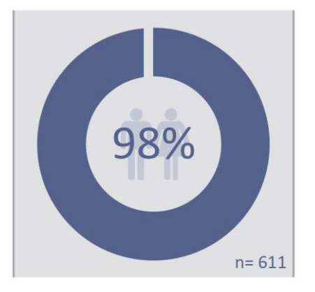
Teachers agreed that the teacher taking on the role of facilitator coach strengthens students' mathematical understanding.

Almost all participating teachers indicated that the role of teacher as instructional "facilitator" or "coach," which is embodied in the Challenges, supports increasing students' mathematical understanding. Compared to providing direct instruction, coaching enables students to take on a more active learning role.