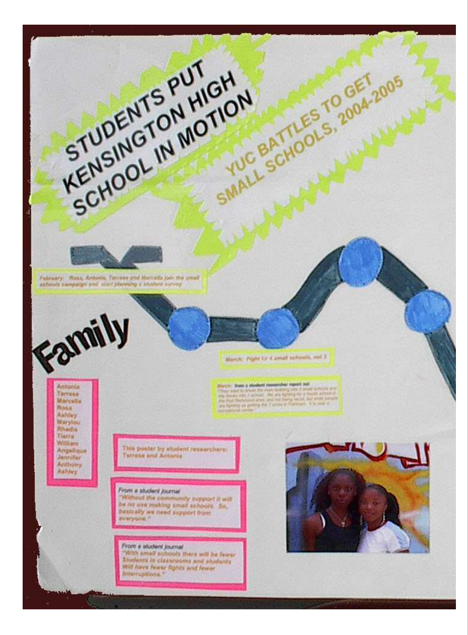
This roadmap represents our small schools campaign journey in 2004-05